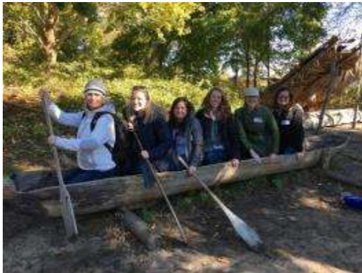
Third Grade teachers enjoyed the trip to Plimoth Plantation!