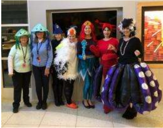
The main office joined in the fun during our Halloween Parade last week.