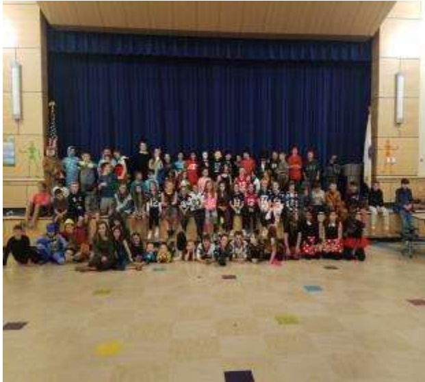
Sixth Graders enjoyed their Halloween Dance this October.

Greetings! We hope you enjoy this first issue of the 2018- 2019 Penn Brook Perspectives! Much of the content was written by 6th grade students, during their recess, eager to try their hand at reporting; they did an excellent job gathering and summarizing much of the learning and activities that are taking place at each grade level. As I'm sure you know from your child's teacher and from the article in this publication, we are teaching a new social/emotional curriculum, Second Step at each grade. Second Step teaches skills that help students manage their emotions, cope with every day academic and social situations, and, form healthy relationships, all of which improve a student's ability to learn. A related advantage of the program is that through role playing and partner